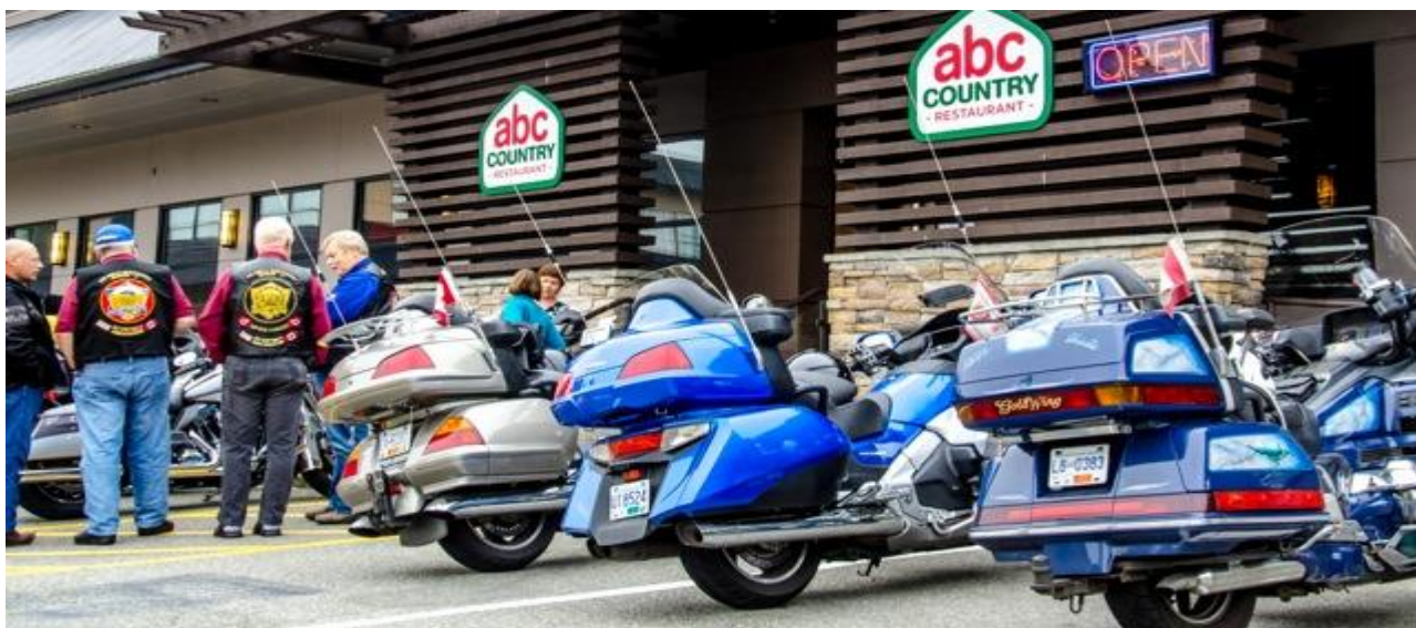
Breakfast meeting at ABC