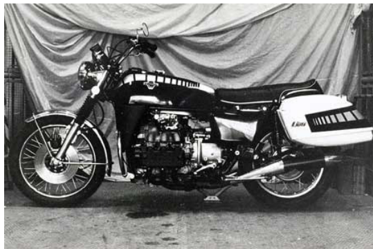
Very rare photo of the very first prototype Honda Goldwing - The 1972 Honda M1