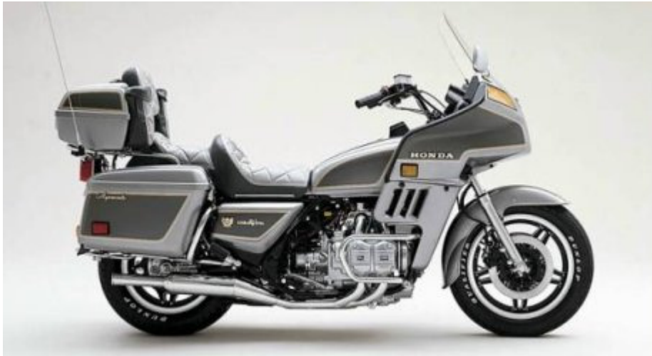
1982 Goldwing GL1100 Aspencade