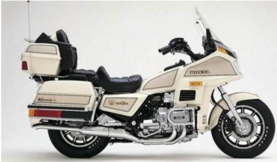
1986 Goldwing 1200 Aspencade SE-i

In 1983, Honda made a few substantial changes for the final year of the GL1100. This includes an LCD dashboard, anti-dive forks and a change to the transmission to improve fuel economy. The size of the trunk was also increased, and the seat and footpegs for the passenger were moved to provide more comfort.