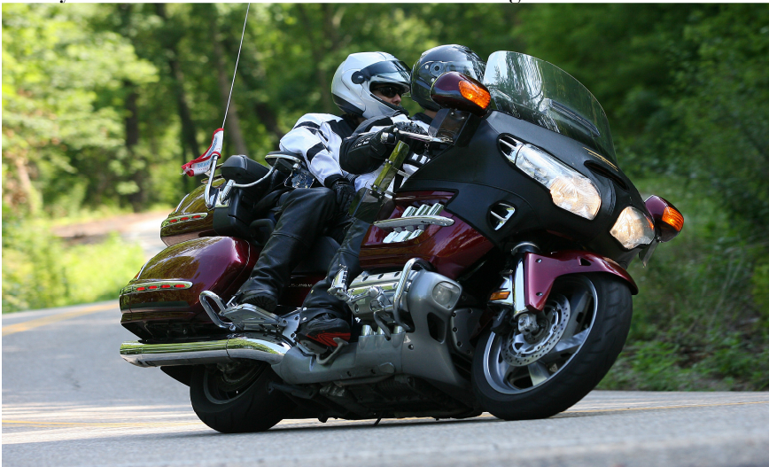
Rob & Terry Ellis

Our trip was full of wonderful experiences like the unbelievable cooking from a fellow known simply as, 'Cajun' (Long story ask me about it) and 1000 miles riding in the rain, torrential rain! But we were prepared, so it was hardly an inconvenience. We can't wait to do it again !